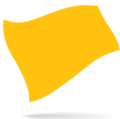
YELLOW Danger ahead – slow and be prepared to take avoiding action