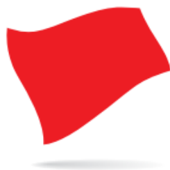
RED Stopping the race or practice