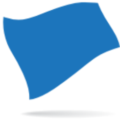
BLUE Overtaking signal

The illustrations below provide a quick colour reference to the flag signals set out in Appendix H. Refer to “Track Control and Flag Signalling (Appendix H to the NCR)” in “Race” in the CAMS Manual of Motor Sport for full information on these and other signals which are used in motor racing.