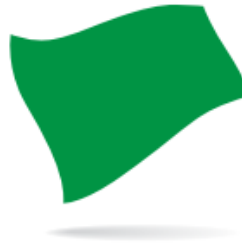
GREEN All clear ahead