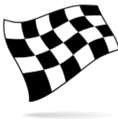
BLACK & WHITE CHEQUERED Finishing flag – end of race or practice