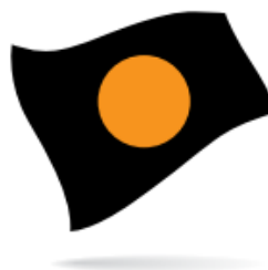
BLACK WITH ORANGE DISC Mechanical problems: stop at pit on the next lap