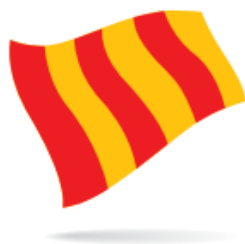
YELLOW WITH RED STRIPES Deterioration of adhesion / slippery surface ahead