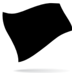
BLACK Enter pit lane on the next lap